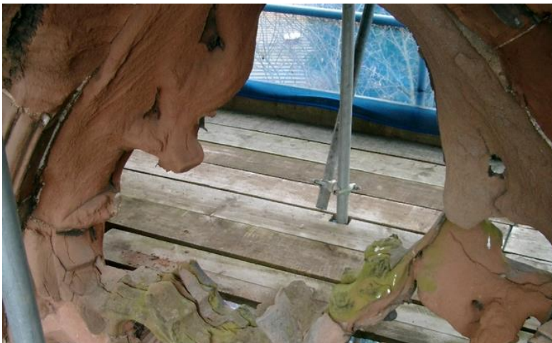
Original Tracery to Guesten Hall (Front view)